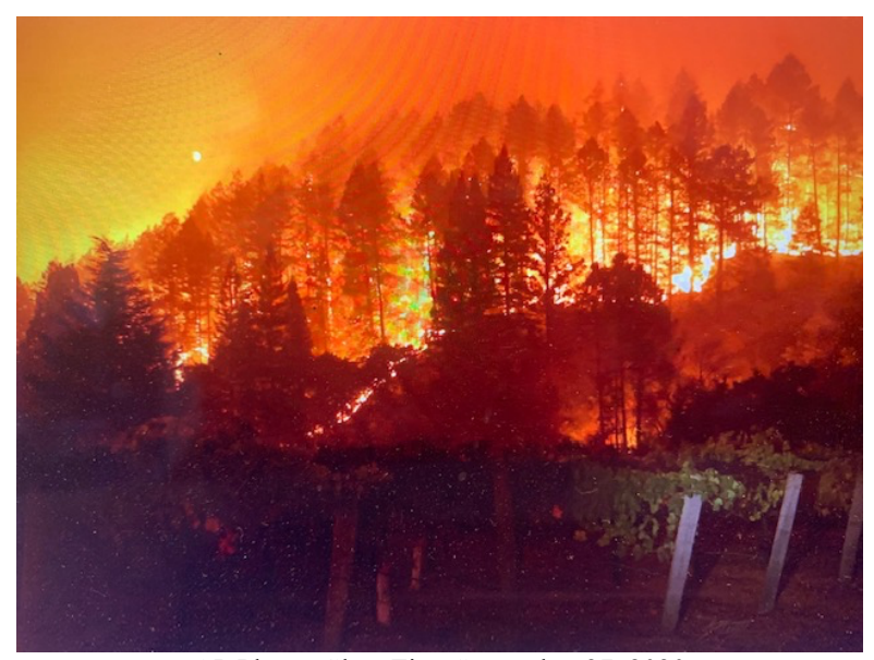
Glass Fire September 27, 2020