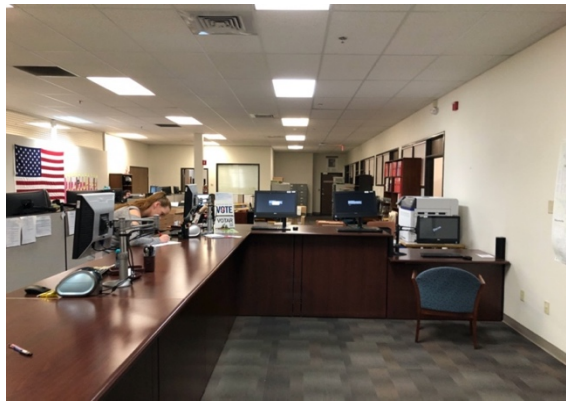
Figure 1. 2019/2020 Napa County Grand Jury. Napa Election Division Office. 2019

Napa County has 170 different precincts, each requiring a unique paper ballot. A precinct ballot is based on the combination of multiple cities, school districts, police districts and municipal districts across Napa County. ProVote, a private third-party service company located in Paso Robles, prints the ballots for all individuals who are registered by the print deadline. 19