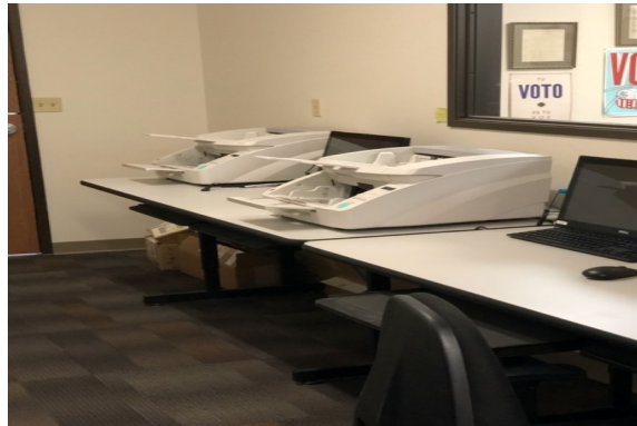
Figure 5. 2019/2020 Napa County Grand Jury. Ballot Scanning Machines. 2019

In the November 6, 2018 election, 50% of the ballots were returned by mail (USPS), 31% via the drop boxes and 19% at the Vote Centers.