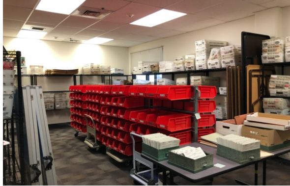
Figure 2. 2019/2020 Napa County Grand Jury. Secure ballot room. 2019.

In addition, individuals can register to vote and obtain ballots at one of the ten Napa County Vote Centers. 20 One of these Vote Centers opens 29 days prior to an election, and one additional Vote Center opens 10 days before an election. All 10 Vote Centers are open the Saturday prior to the election. (See Appendix 2.) Each Vote Center is equipped to provide conditional voter registration and a ballot printed on a state certified Mobile Ballot Printer from any of the 170 county precincts.