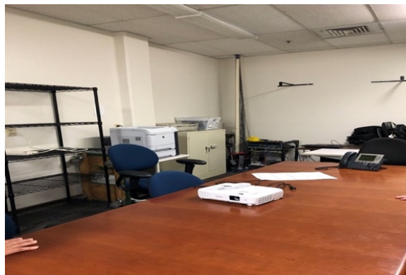
Figure 4. 2019/2020 Napa County Grand Jury. Ballot Counting Room. 2019

Prior to election day, a test of the vote counting scanners is performed by election officials. A set of pre-marked sample ballots are manually counted then processed through the vote counting scanners. The results are compared for accuracy, recorded and transmitted to the Secretary of State. The public is invited to witness the process.