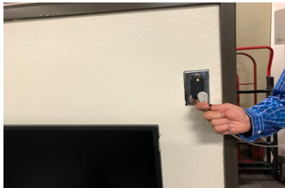
Figure 3. 2019/2020 Napa County Grand Jury. 2019. Key Fob Access to Ballot Room. 2019.

The ballot room is only accessible with a unique key card assigned to a vetted election department individual. Access is monitored, recorded and saved to a server with a time stamp and employee identification. Room access data is stored for a minimum of one year.