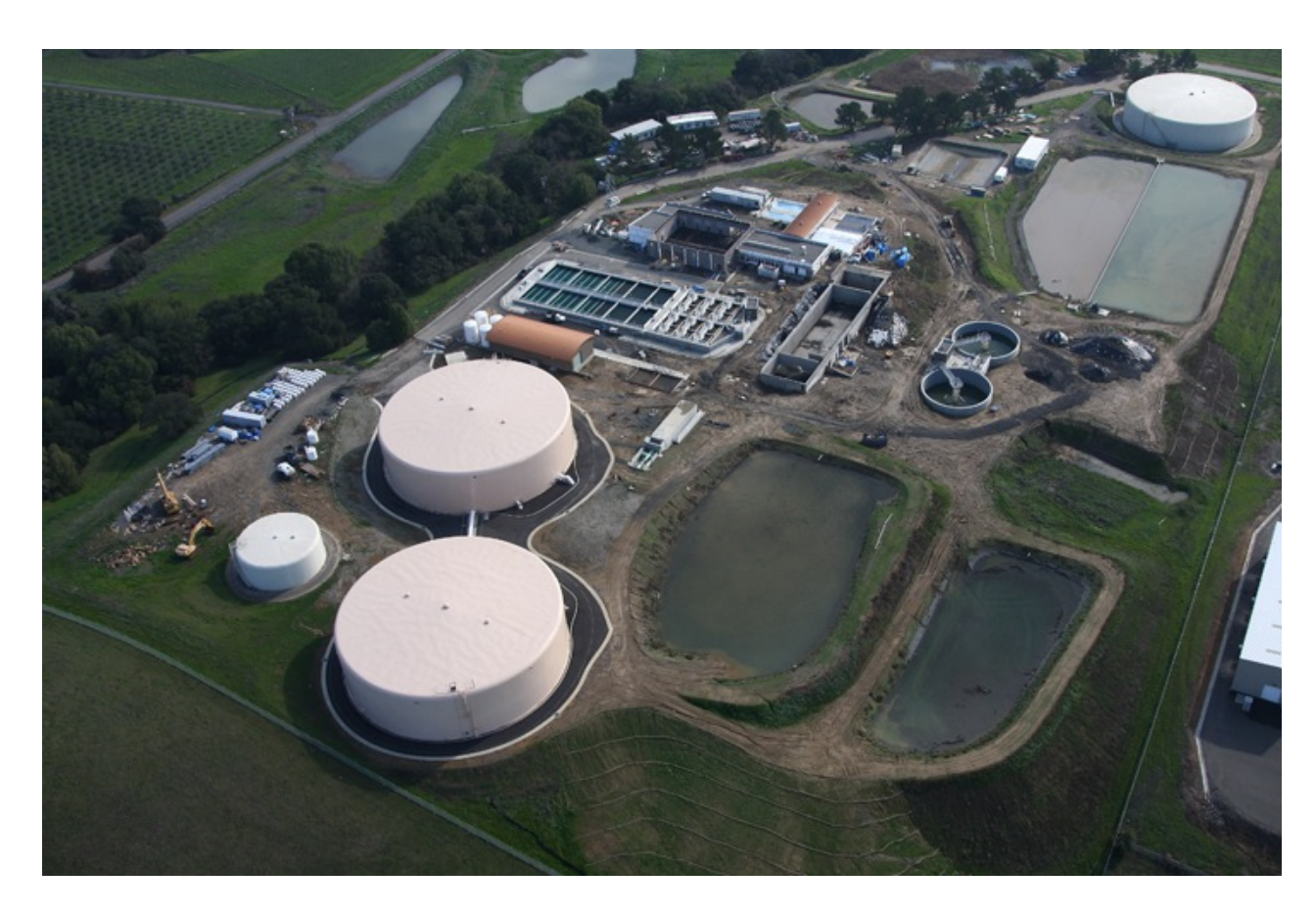
Jamieson Water Treatment Plant aerial view.

Approximately 50% of Napa County drinking water is sourced from Napa County lakes and reservoirs.