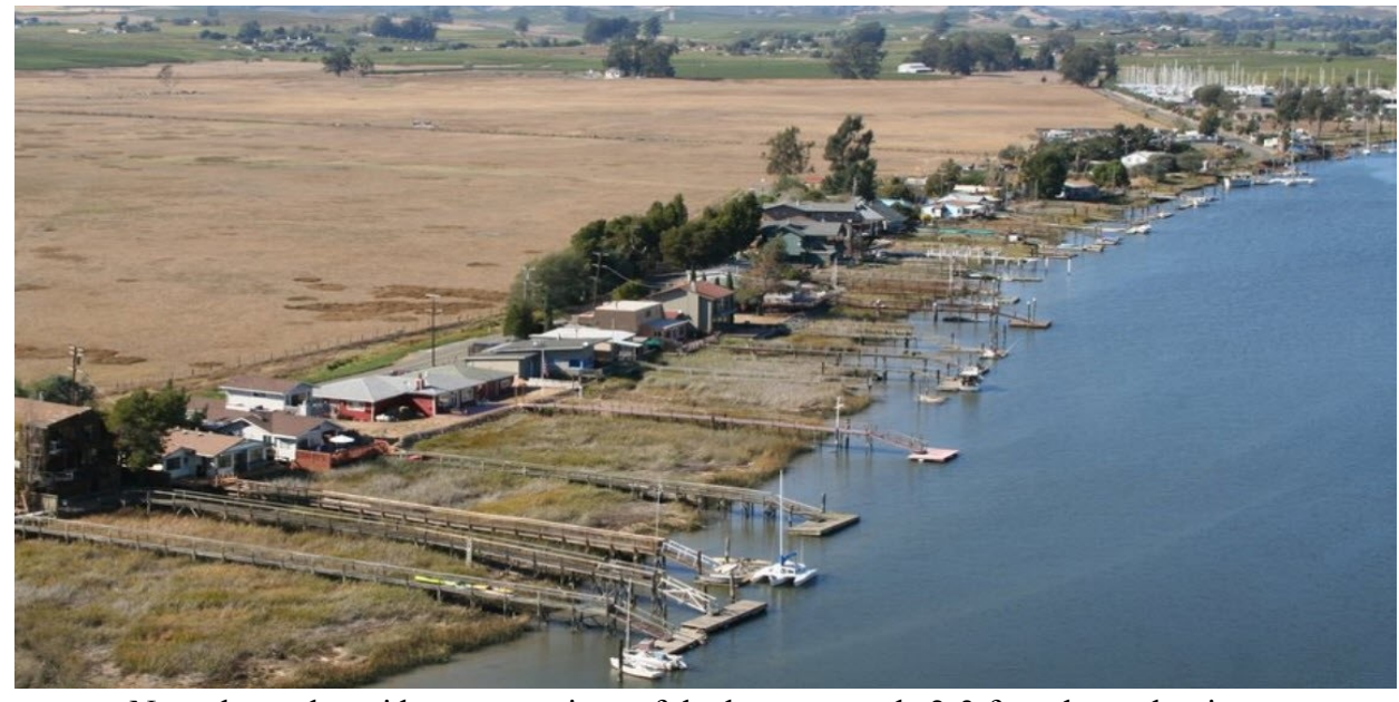
Figure 3. Levee Access Restricted by Boat Docks and Piers

Note that at low tide most sections of the levee are only 2-3 feet above the river; they are much less at high tide.