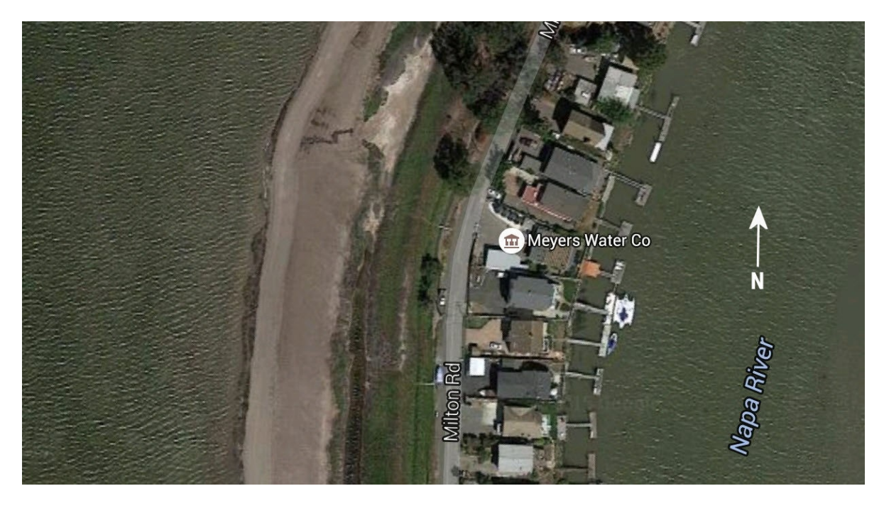
Figure 2. Aerial View of Edgerly Island

High tide waters push into the slough on the west side of the development; there is only a partial levee protecting the west side. The Napa River abuts against the levee on the east side.